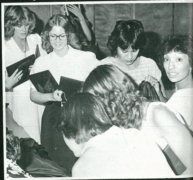
When graduation was over it was time to turn in the caps and gowns and hurry to the youth center for Ring Turning.